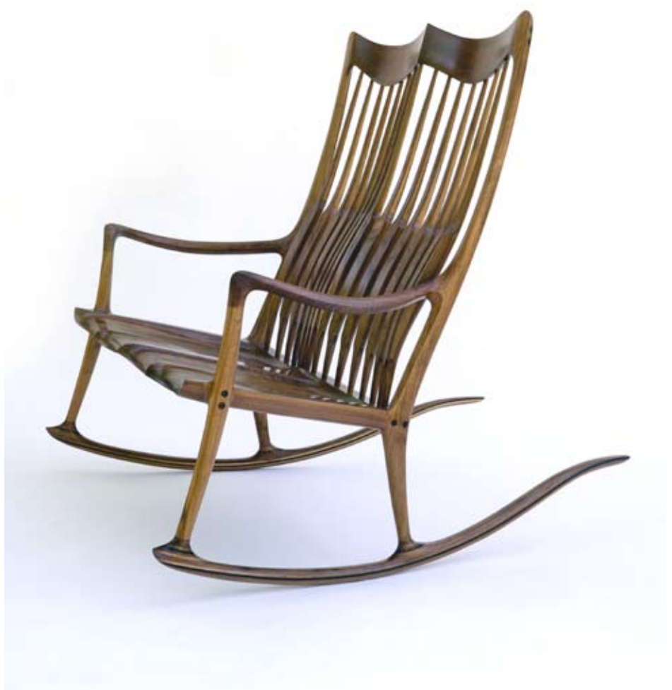
Sam Maloof, Double Rocker, 2006

To this day, calls himself a woodworker, rather than an artist