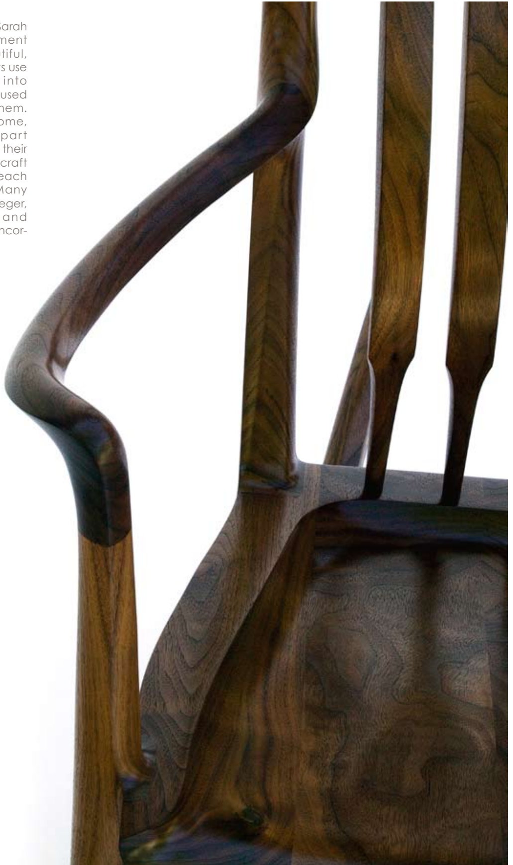
Sam Maloof, Double Rocker, 2006