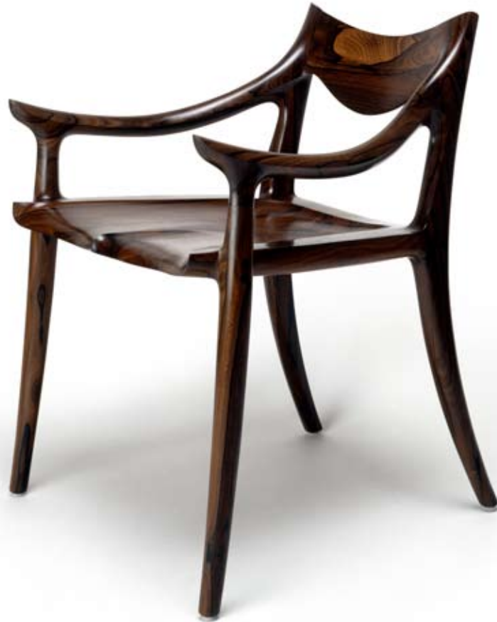
Sam Maloof, Side Chair, 1975